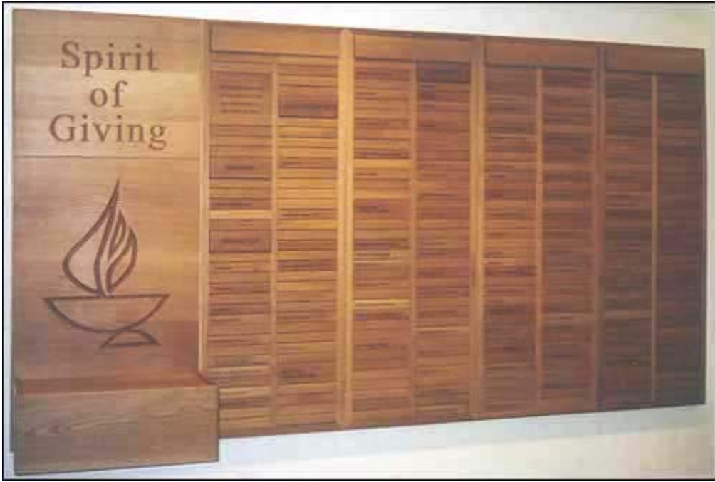
The Donor Wall, First Unitarian Church, Portland, Oregon